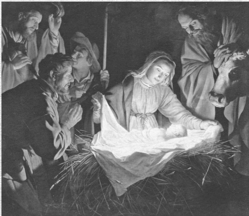
Child born to Joseph of Nazareth, and Mary, in a local stable in Bethlehem while traveling to be registered.