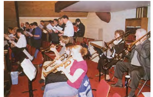
2004 Choir & Band