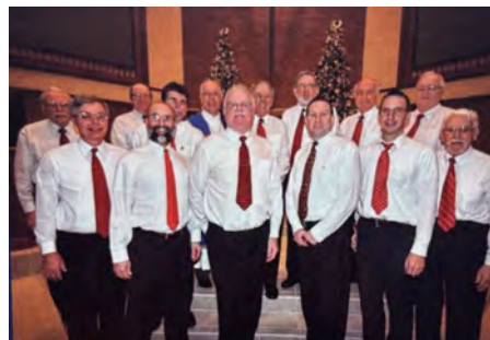
2010 Men's Choir