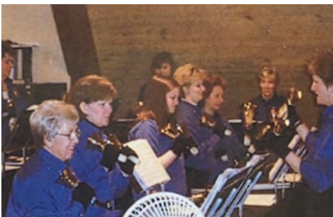
2004 Bell Choir