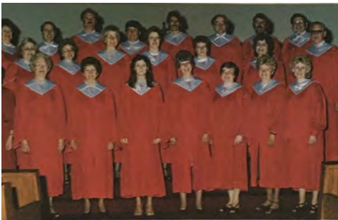
1986 Adult Choir

The Historical Committee wishes everyone a Blessed Christmas and a Wonderful 2026.