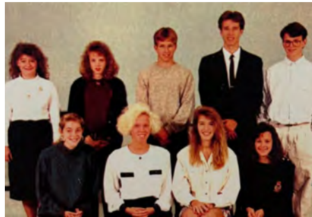
1991 Youth Choir