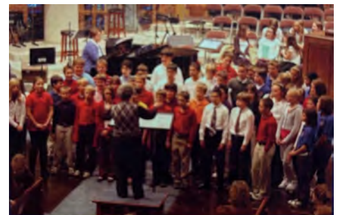
2010 School Choir