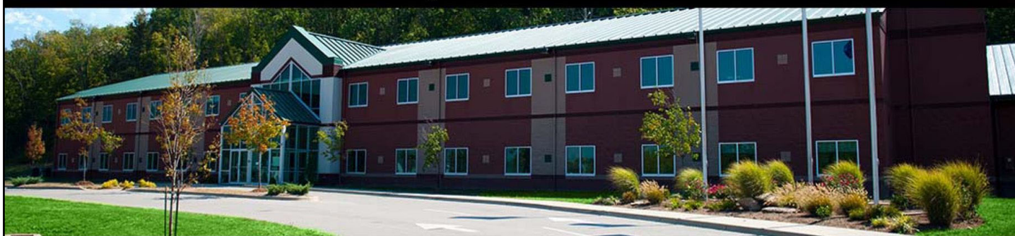
SOUTHWEST CAMPUS March 16, 6 p.m. and 7 p.m.

Do you know someone that wants a Christian education for their child? Invite them to attend our Open House for prospective families on Thursday, March 16! Guests should register online by clicking here .