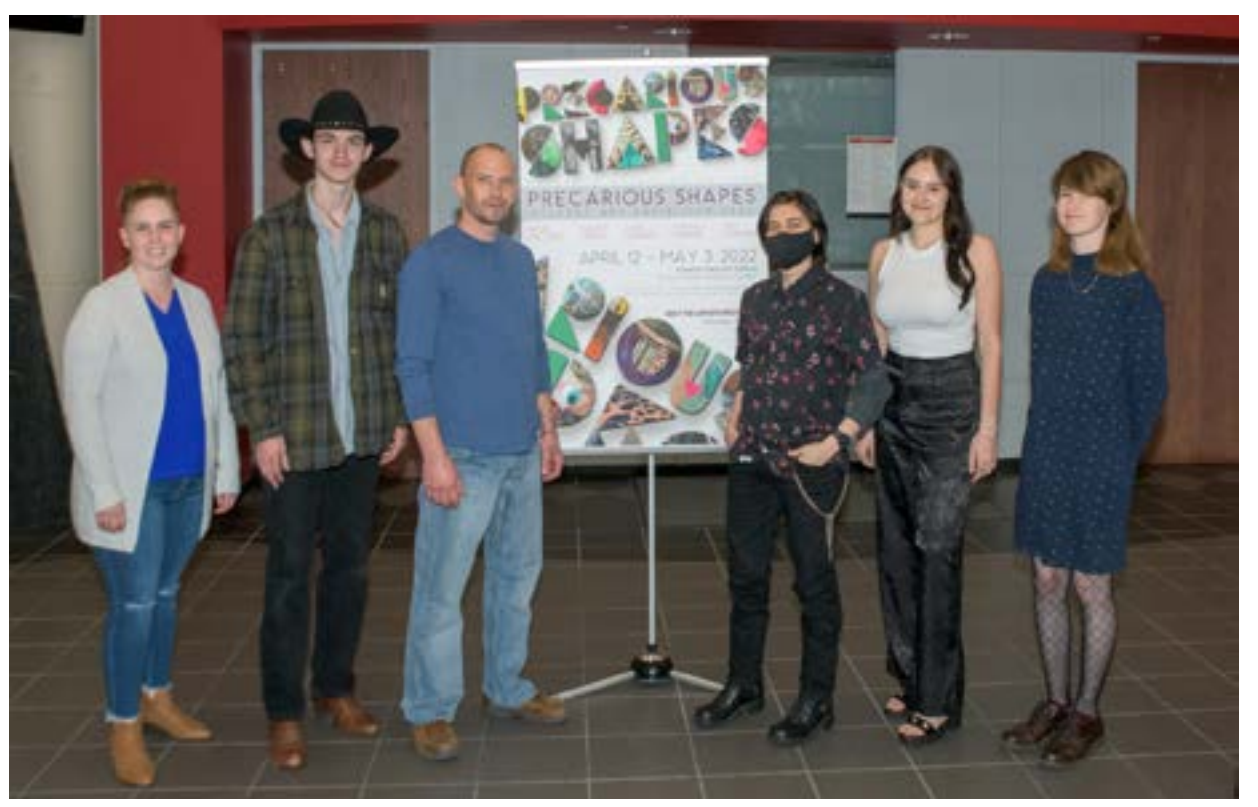
NOC Tonkawa Student Artists are exhibiting art through May 3 at the Eleanor Hays Gallery inside the Kinzer Performing Arts Center.