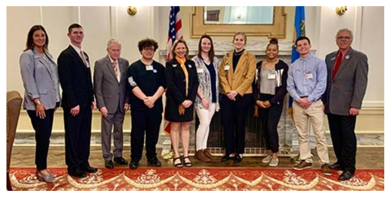
NOC students and administrators attended the State Capital Wednesday for the annual Oklahoma Promise Day (photo provided)