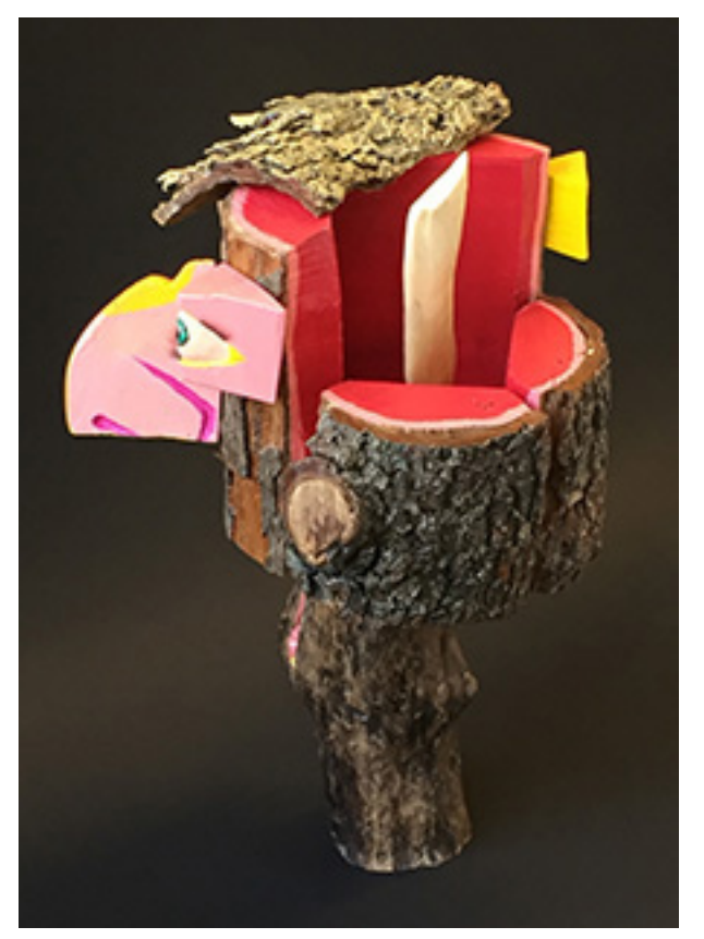
View of Cross Sections of Mo by Zoe Oxford awarded "Best of Show" and "First Place in Sculpture."