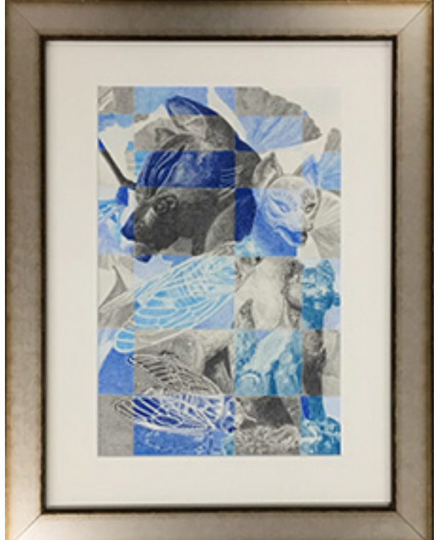
View of Foxes and Cicadas by Kelsey Grigg awarded "Honorable Mention" in Drawing.