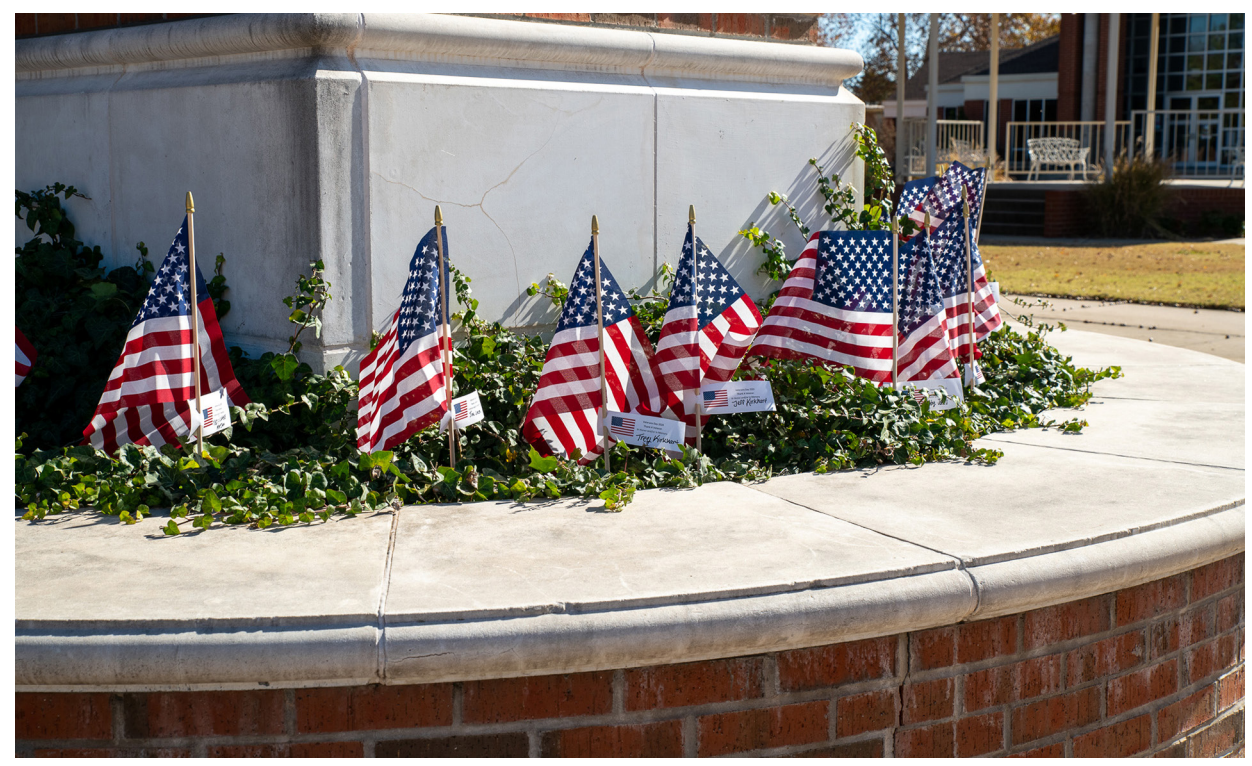
NOC Tonkawa students wrote the names of veterans and placed them in the clocktower flower bed to honor those who served our country.