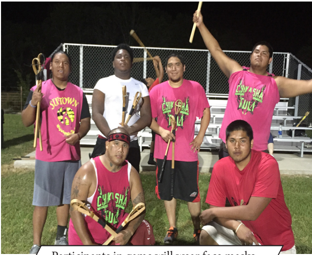
Participants in game will wear face masks and take precautions.

Like Us! Cultural Engagement Center NOC @CECatNOC