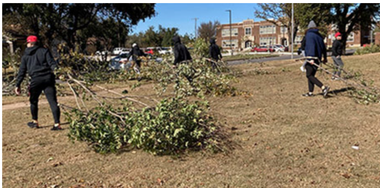
NOC Enid baseball players helped with storm damage this week on the NOC Enid campus.