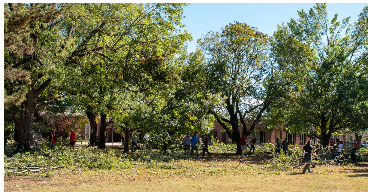
NOC Tonkawa baseball players assisted with ice storm damage Friday afternoon on the NOC Tonkawa campus.