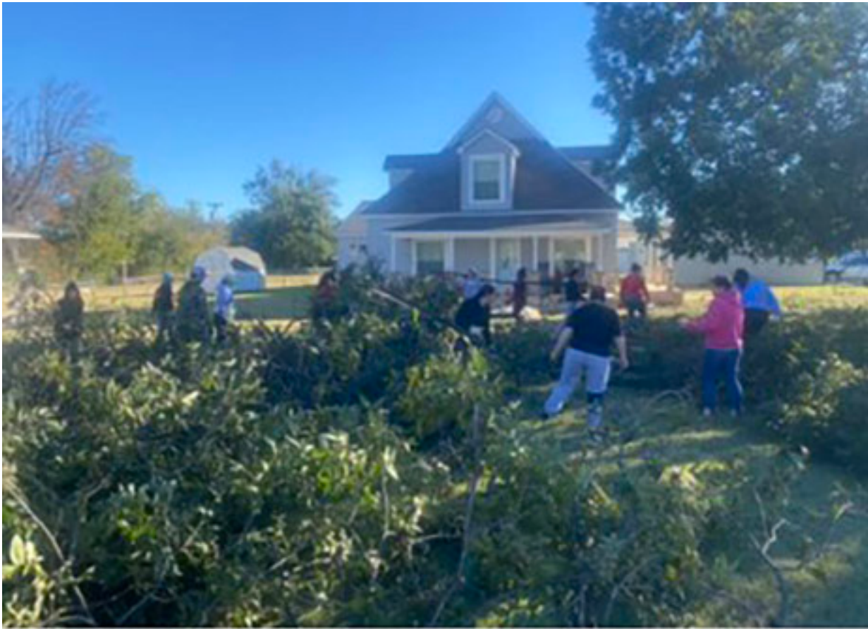
NOC Tonkawa softball players assisted in removing debris from this week's ice storm.