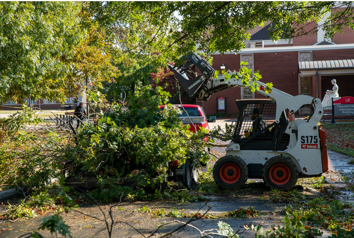
The NOC Tonkawa Maintenance Crew cleaned up the NOC Campus this week after this week's ice storm.

For additional information, visit the following links: NOC Calendar