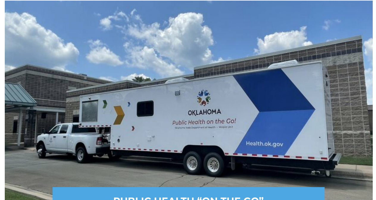
PUBLIC HEALTH “ON THE GO”